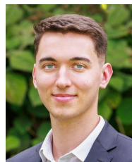
James Markovic 94195555

Price : $1,000,000 - $1,100,000 Land Size : 232 sqm View : https://www.petermarkovic.com.au/sale/vic/inner-city/collingwood/residential/house/8114947